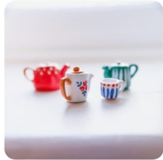
Delphine Doreau on Instagram: ... Delphine Doreau