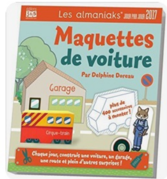
Almaniak Activités Maquettes de voitures 2017