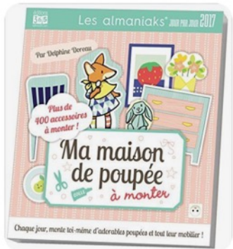
Almaniak Activités Ma maison de poupées à monter 2017