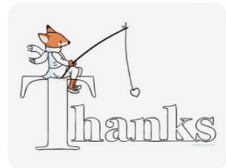
Thank you card — Le Lapin dans la Lune