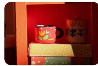
Delphine Doreau on Instagram: ... Delphine Doreau