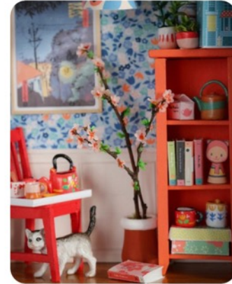
Delphine Doreau on Instagram: ... Delphine Doreau