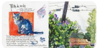
Die blaue Katze — Le Lapin dan... Delphine Doreau