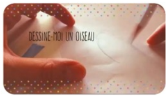
dessine moi un oiseau Delphine Doreau