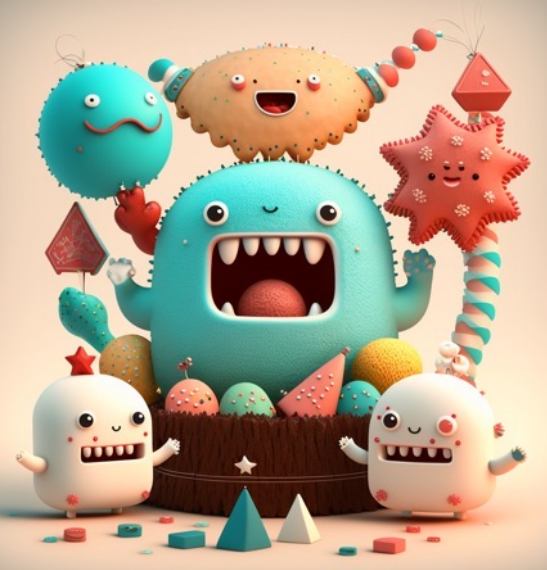
Happy little monsters in your Xmas tree