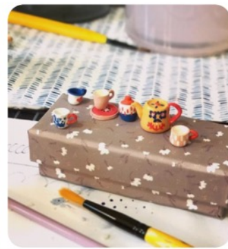
Delphine Doreau on Instagram: ... Delphine Doreau