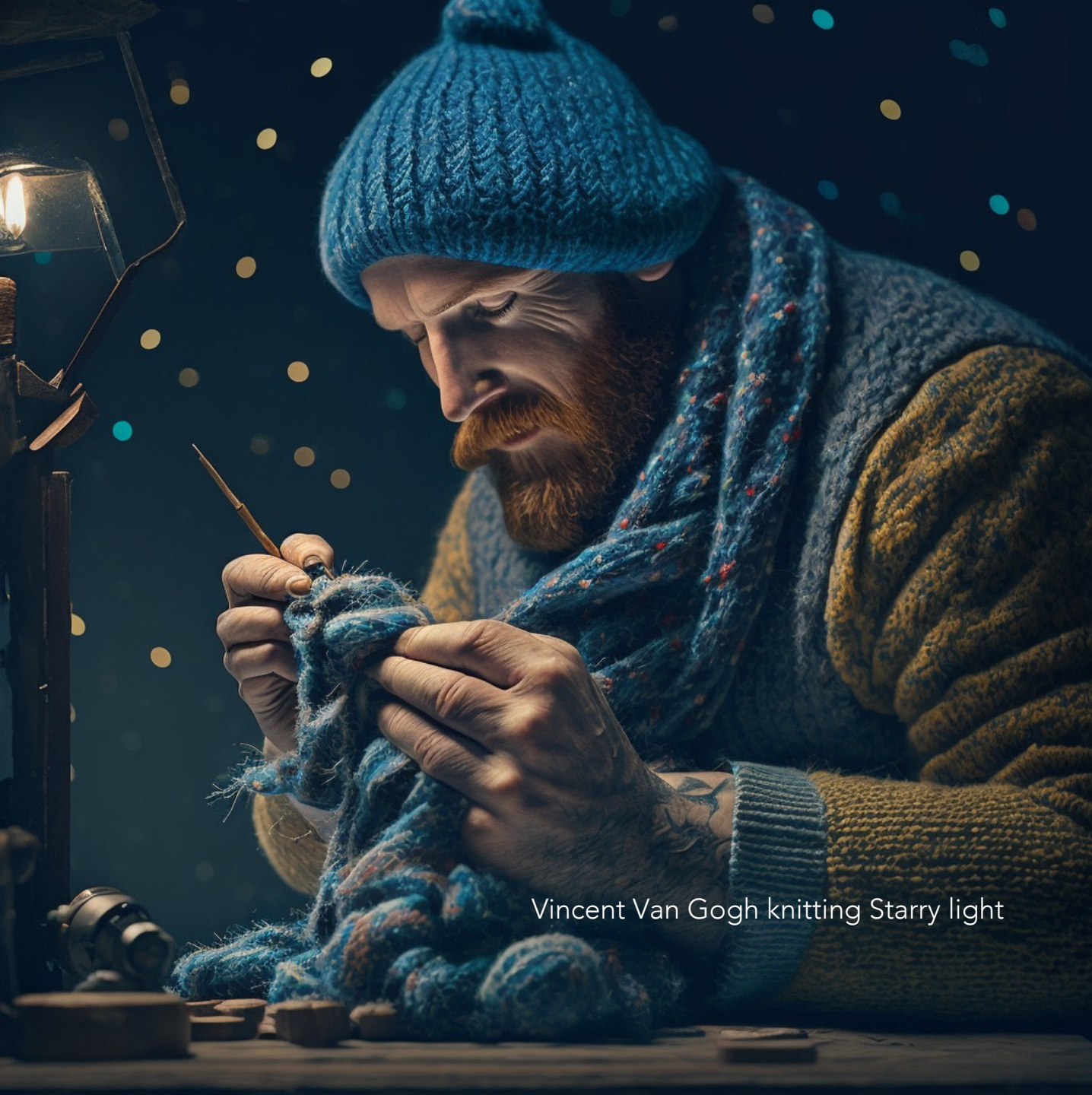
Vincent Van Gogh knitting Starry light